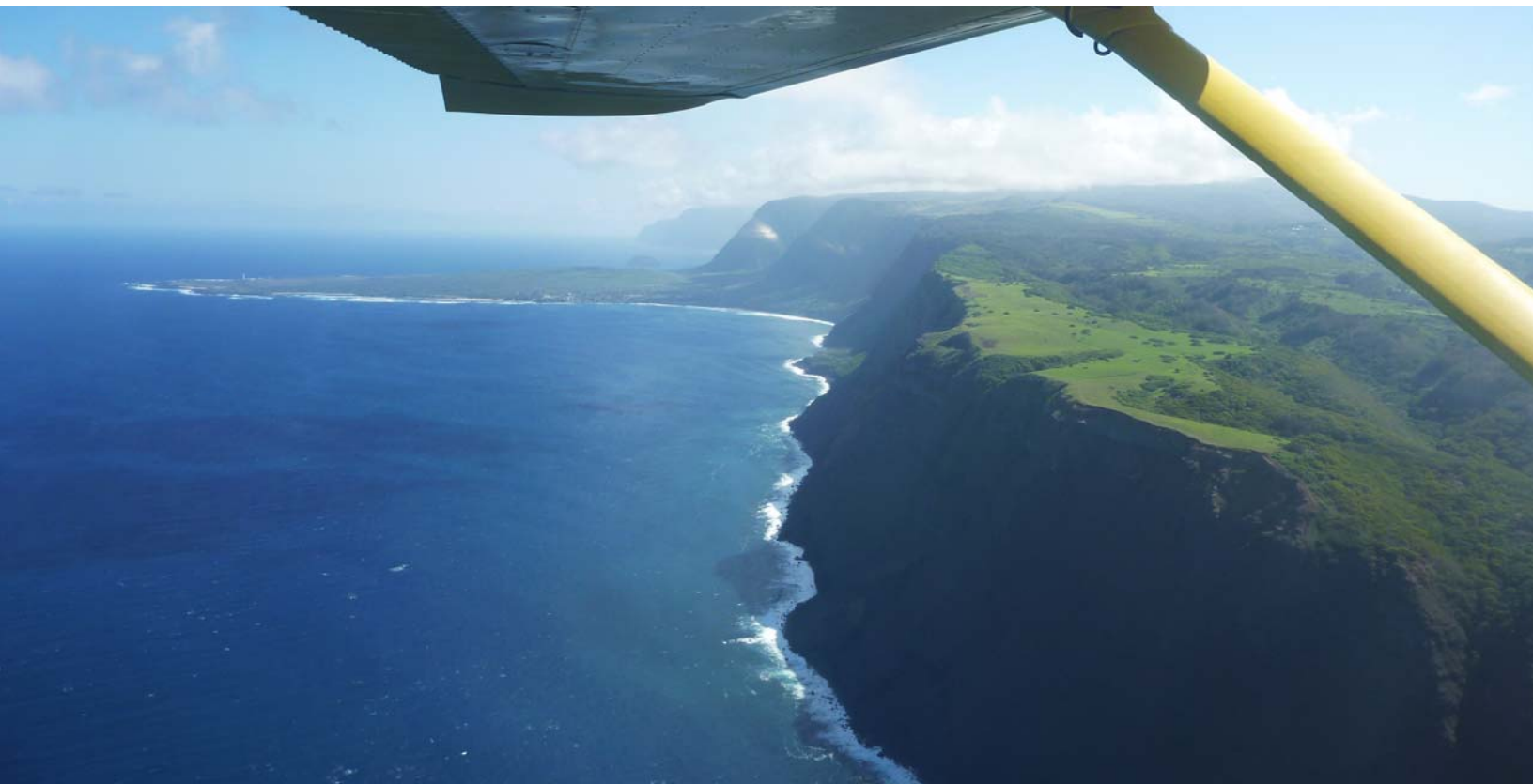
An idea for your next flying adventure? Here's our rented C172 over Kalaupapa Peninsula, Moloka'i Island, Hawai'i.

The next regular meeting will be Wednesday, January 6, 2016.