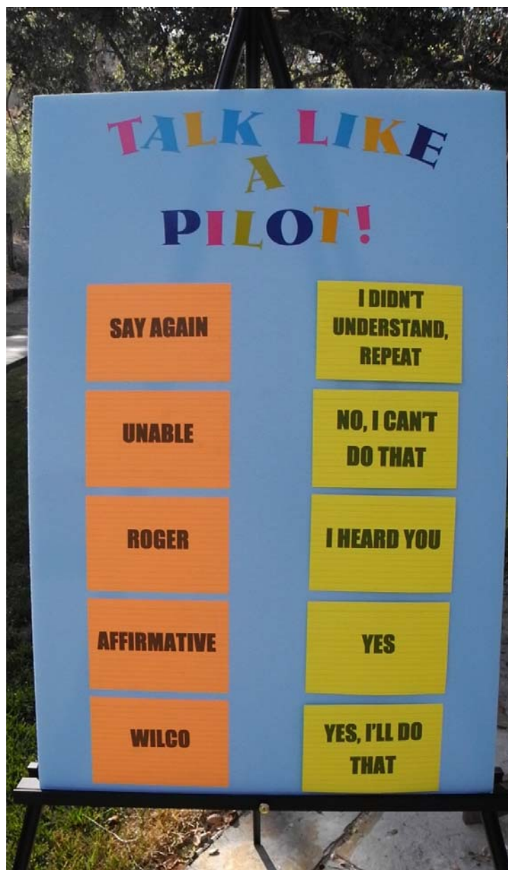
One of the kid's activities at the Oct 18 airport day. More photos in the next edition. Activity & photo by Kathy.