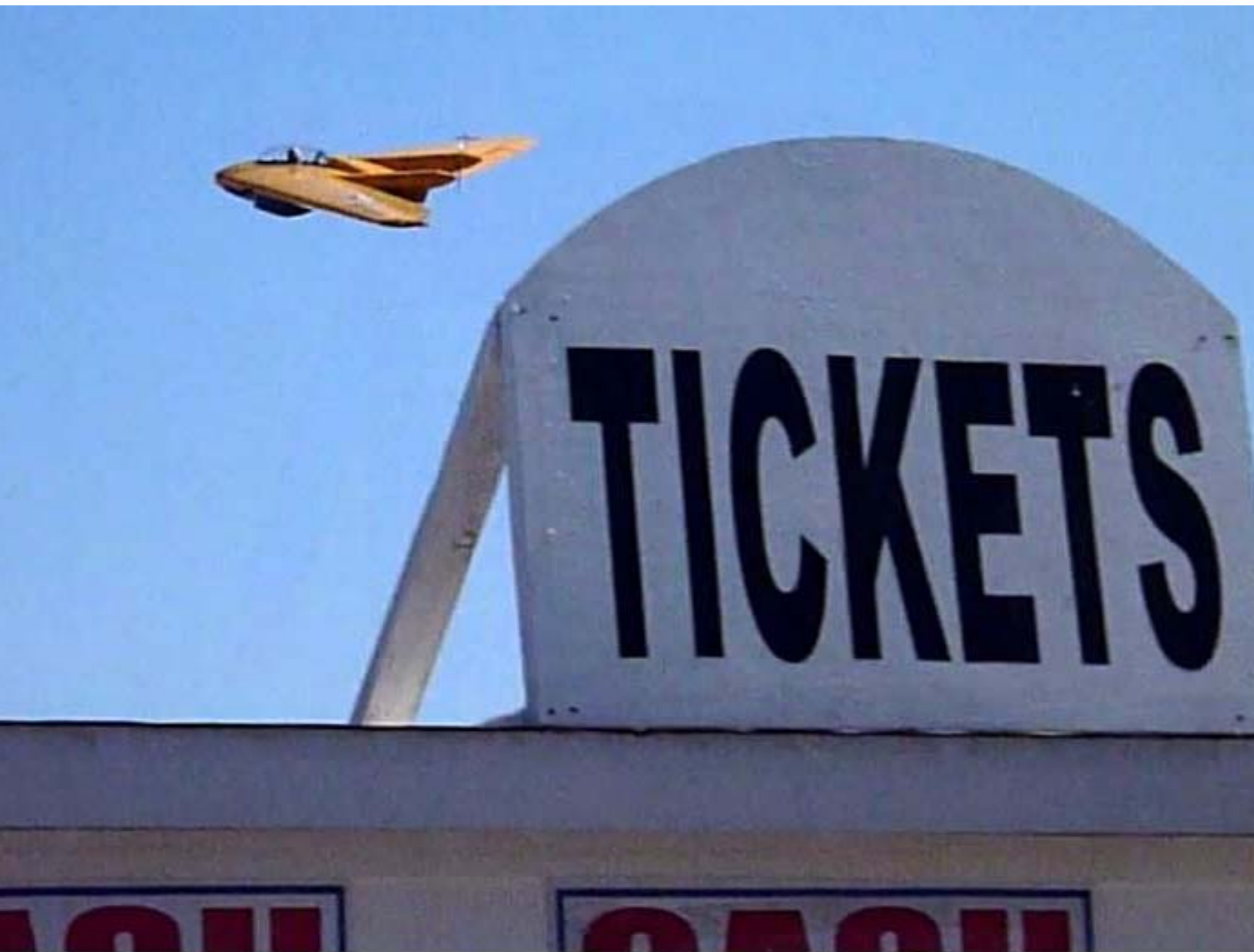
Northrop N9MB Serial #4 prototype at the "Warbirds over Paso 2013" show Oct 5 (member photo submission, see more photos on pages 3 and 4)