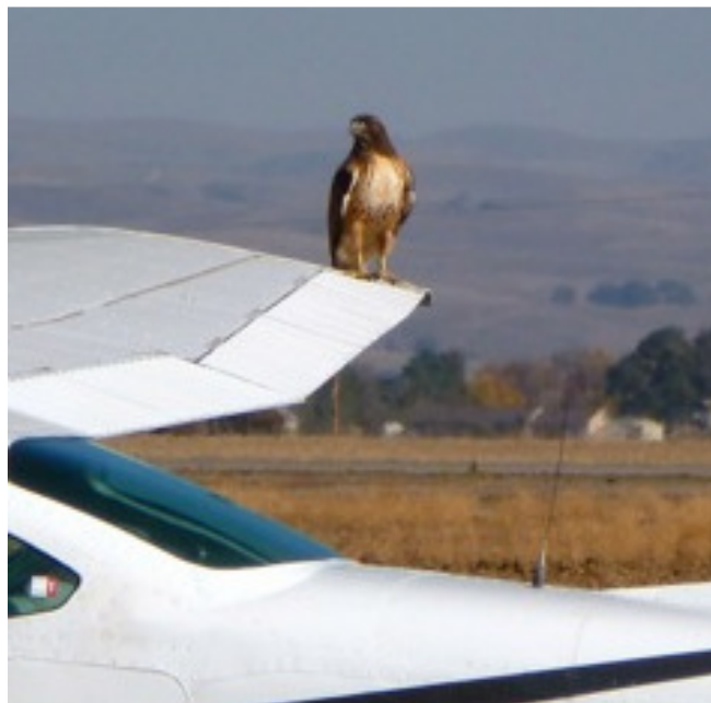
Special guest at the Paso Robles flyout