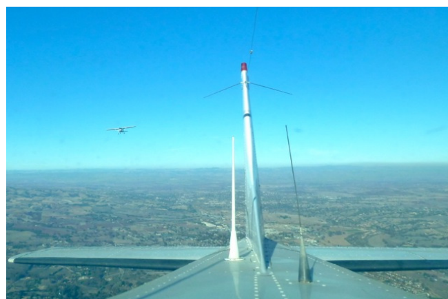
99s in the air at the Paso Robles flyout