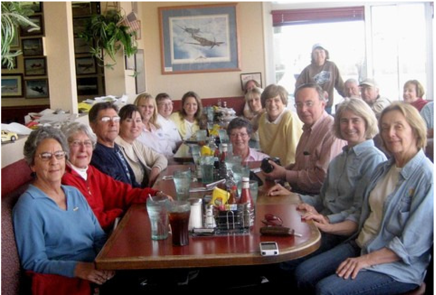
Fox Field fly-out crew, from SLO, Santa Maria, Ventura, and Antelope Valley (see report on this page)