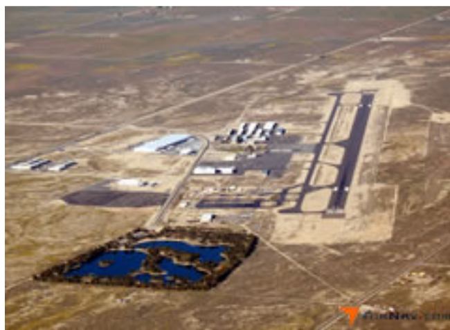
Fox Field, Lancaster, CA , about 40 miles north of Los Angeles. (see report on page 4)

Near home, ATIS at SBP again reported turbulence southeast of the airport 6000 feet and below. From New Cuyama homeward the trip got increasingly choppy. To avoid the area of reported turbulence I elected to do my let down over the Santa Maria Valley rather than use the direct route over Lopez Lake: tower gave me a left base entry for 29. Winds were 360 at 16 knots (a direct crosswind and one knot less than the maximum demonstrated crosswind component of my aircraft). As I prepared for landing in the crosswind I recalled "a go-around" is always an option and I prepared for that eventuality. While a fun filled day was had by all, I would be remiss not to mention the controllers who went along with us every mile of our trip. From my initial call to SBP Ground, to SBP tower to the enroute controllers, you knew you were in good, caring hands, guided by professionals who added a valuable safety element to the experience. All the controllers I encountered lived up to their motto "we bring you home."